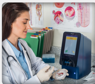
1 / Add sample

From sample to complete panel results in 3 simple steps and approximately 12 minutes